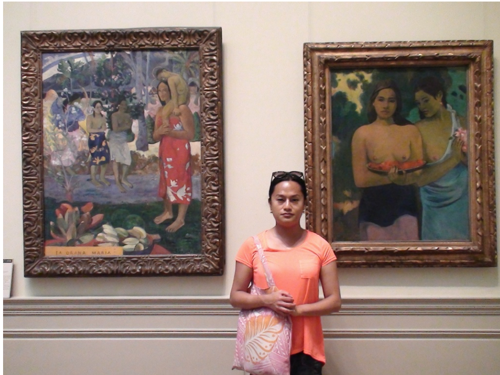
Figure 4. Artist Yuki Kihara at the Metropolitan Museum of Art, New York, 2008.

In Paradise Camp , each photograph, clipping, or remembrance marks a different time in Kihara's life, fa'afafine and fa'atama history, Pacific history, or the history of us all. Kihara has gathered these sources over her lengthy career and, looking at them individually, one can glimpse moments of space and time. For example, the moment in which Paradise Camp was conceived is represented in three photographs on the right edge of the vārchive. In the largest one, Kihara stands in front of two iconic Gauguin paintings at The Metropolitan Museum of Art in New York (Fig. 4). In the photograph, Kihara's gaze is direct; the photo was taken over a decade ago, yet the viewer standing before it feels seen by the artist. In the exhibition catalogue, curator Natalie King relates that Kihara "returned repeatedly to view Gauguin's paintings" while her own exhibition, Living Photographs , was on view at The Met in 2008. 9 If a center to this exhibition were to be pinpointed, this grouping of photographs would be a moment of genesis.