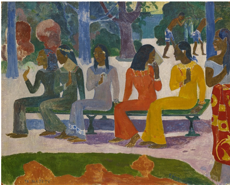
Figure 9: Paul Gauguin, Ta matete (We shall not be going to market today) , 1892. Oil on canvas, 73.2 x 91.5 cm. Kunstmuseum Basel. 19