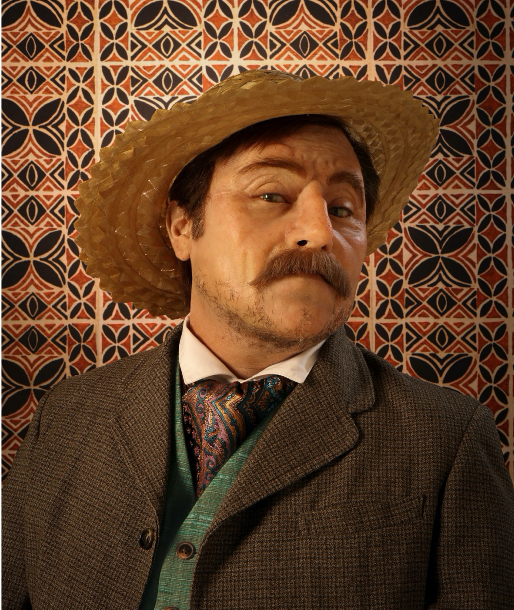
Figure 13. Yuki Kihara, Paul Gauguin with a hat (after Gauguin) , from the Paradise Camp series, 2020. Hahnemühle fine art paper mounted on aluminum, 45 x 38 cm. Commissioned by the Arts Council of New Zealand Toi Aotearoa for the 59th International Art Exhibition of La Biennale di Venezia, 2022. Courtesy of Yuki Kihara and Milford Galleries, Aotearoa New Zealand