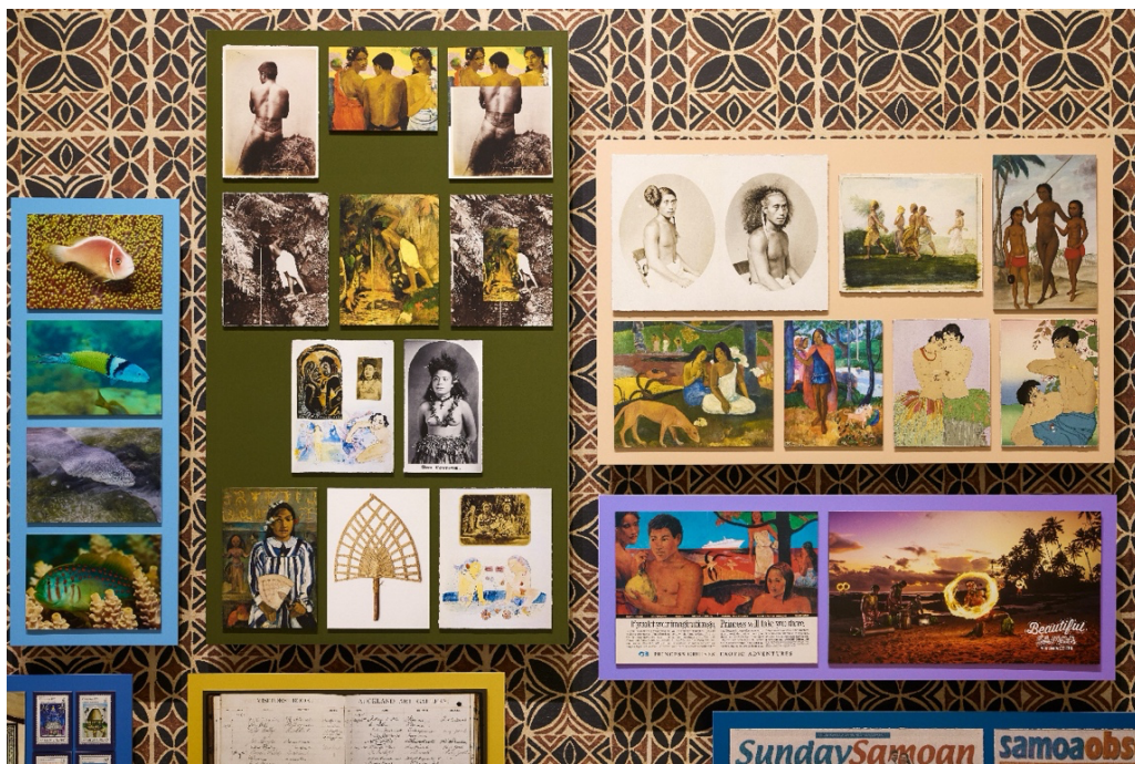
Figure 3. Detail of Yuki Kihara's "Vārchive," Paradise Camp , Aotearoa New Zealand Pavilion, 59th International Art Exhibition of La Biennale di Venezia, April 23–November 27, 2022. Commissioned by the Arts Council of New Zealand Toi Aotearoa.