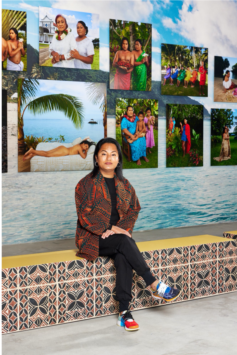
Figure 1. Artist Yuki Kihara in the exhibition Paradise Camp , curated by Natalie King, Aotearoa New Zealand Pavilion, 59th International Art Exhibition of La Biennale di Venezia, April 23–November 27, 2022. Exhibition commissioned by the Arts Council of New Zealand Toi Aotearoa.