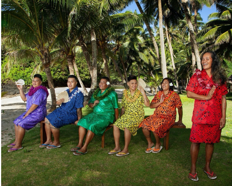
Figure 8. Yuki Kihara, Genesis 9:16 (After Gauguin) , from the series Paradise Camp , 2020. Hahnemühle fine art paper mounted on aluminum, 73.2 x 91.5 cm. Commissioned by the Arts Council of New Zealand Toi Aotearoa for the 59th International Art Exhibition of La Biennale di Venezia, 2022.