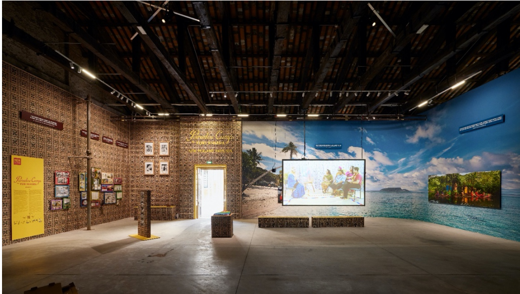
Figure 2. Installation view of Paradise Camp , Aotearoa New Zealand Pavilion, 59th International Art Exhibition of La Biennale di Venezia, April 23–November 27, 2022. Commissioned by the Arts Council of New Zealand Toi Aotearoa.