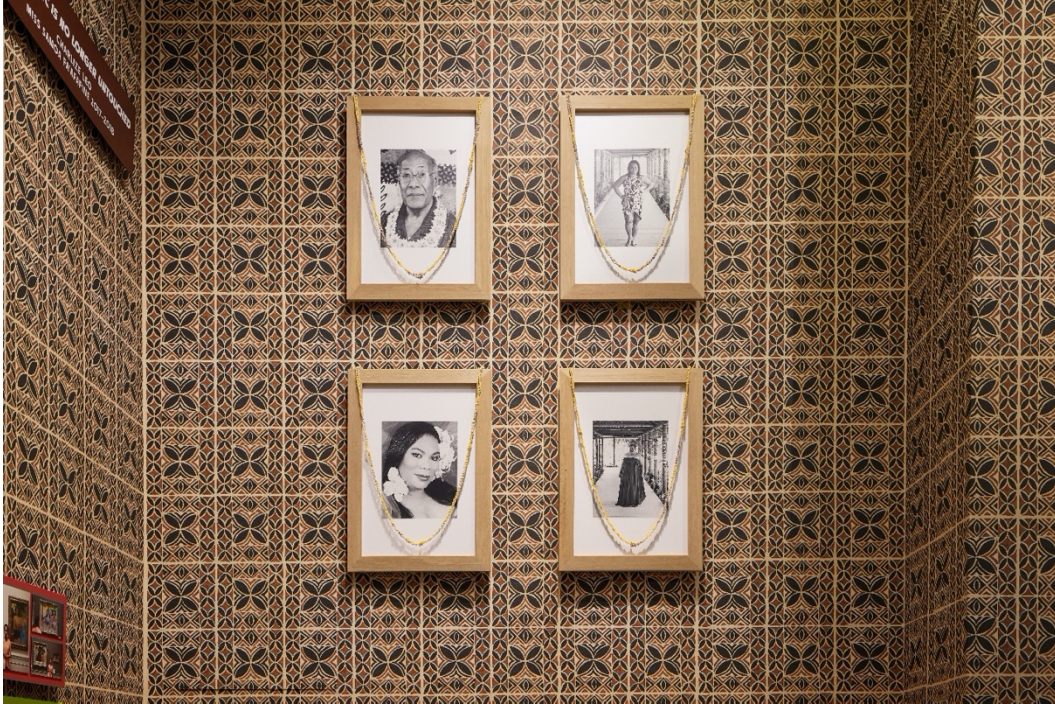
Figure 6. Installation view of Yuki Kihara, Fa'afafine Ancestors , in the exhibition Paradise Camp , Aotearoa New Zealand Pavilion, 59th International Art Exhibition of La Biennale di Venezia, April 23–November 27, 2022. Commissioned by the Arts Council of New Zealand Toi Aotearoa.

On the wall behind the Vārchive was a wallpaper covered with patterns that are applied to siapo (Sāmoan barkcloth). Siapo is highly treasured, lending gravitas to its exchange and marking reciprocal relationships as special. The siapo -patterned wallpaper extended beyond the main groupings of the Vārchive to a quartet of portraits adorned with shell necklaces (Fig. 6). The four portraits honor late fa'afafine individuals and their contributions to Sāmoan society. 12 Paradise Camp has been heralded for its cheeky insouciance, but moments of sorrow are acknowledged as well. Susan Sontag writes, “Camp is playful, anti-serious,” yet at the same time, “camp taste is a kind of love, love for human nature. It relishes rather than judges.” 13 While the exhibition’s title deconstructs Western notions of the exotic, at the heart of Paradise Camp is love and respect for fa'afafine and fa'atama ancestors, as well as an imperative to cherish communities, land, and the environment.