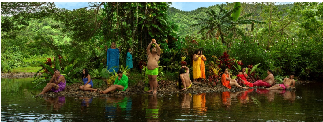
Figure 10. Yuki Kihara, Fonofono o le nuanua: Patches of the Rainbow (After Gauguin) . From the Paradise Camp series, 2020, Hahnemühle fine art paper mounted on aluminum, 139 x 375 cm. Commissioned by the Arts Council of New Zealand Toi Aotearoa for the 59th International Art Exhibition La Biennale di Venezia, 2022. Courtesy of Yuki Kihara and Milford Galleries, Aotearoa New Zealand

In Fonofono o le nuanua , artist and subject agency is reinforced through a collaborative effort mobilized in support of activism. Kihara's nuanced illustrations of lived experience are paramount, unlike the imbalanced power relationship between Gauguin and his models. Kihara's digital collage that superimposes Gauguin's painting with Andrew's photograph emphasizes the suggestive sexuality that Gauguin portrays and the fabulist nature of his life and artistic sources.