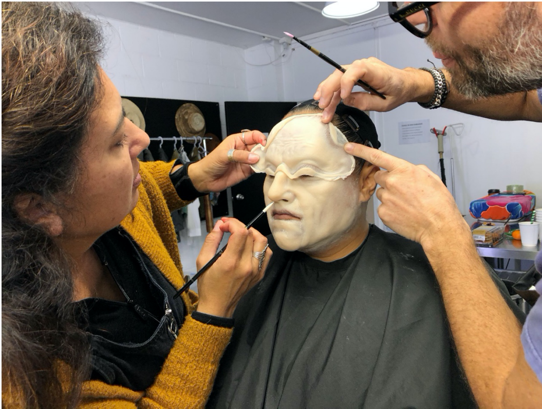
Figure 12. Production still for Paul Gauguin with a Hat (After Gauguin) by Yuki Kihara, from the Paradise Camp series, 2020. Commissioned by the Arts Council of New Zealand Toi Aotearoa for the 59 th International Art Exhibition of La Biennale di Venezia , 2022.

In this instance, caring for the vā goes beyond the exhibition. In conjunction with Paradise Camp , Kihara hosted in-person and virtual discussion forums (“Talanoa: Swimming Against the Tide”) and established the Firsts Solidarity Network, an advocacy initiative for artists, who, like Kihara, are members of marginalized or underrepresented groups in their countries or are representing countries who are participating for the first time. The Firsts Solidarity Network connected artists and facilitated support across national boundaries and provided a map of the five pavilions (Fig. 14).